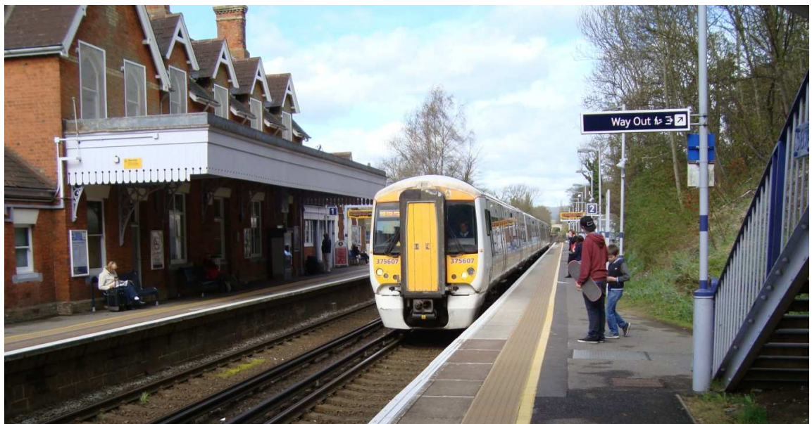
West Malling Station