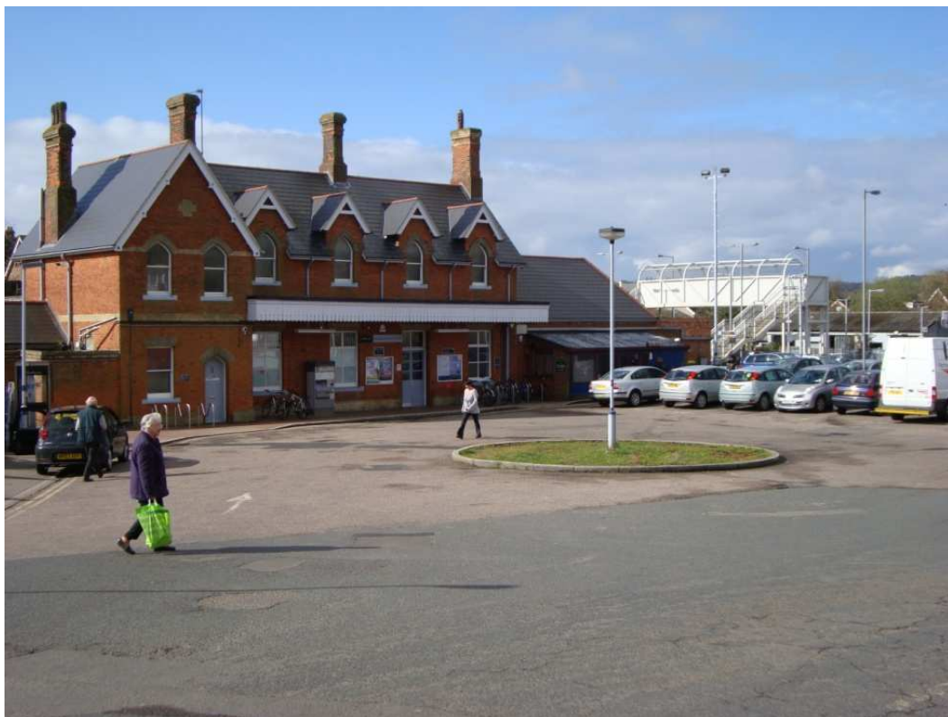
Borough Green Station

To constrain its economic growth potential is clearly contrary to prevailing policy of this Government.