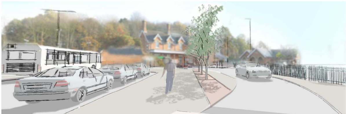
Artists impression of new interchange at West Malling Station

We have been impressed by the willingness of the rail industry to engage with us to promote a current scheme at West Malling Station. The project involves a major remodelling of the forecourt and approach road and we believe this provides a model way of working. Disappointingly, financial contributions from the rail industry and the DfT have been absent. Nevertheless, we are looking to fund works through creative use of Section 106 monies from developments in this area.